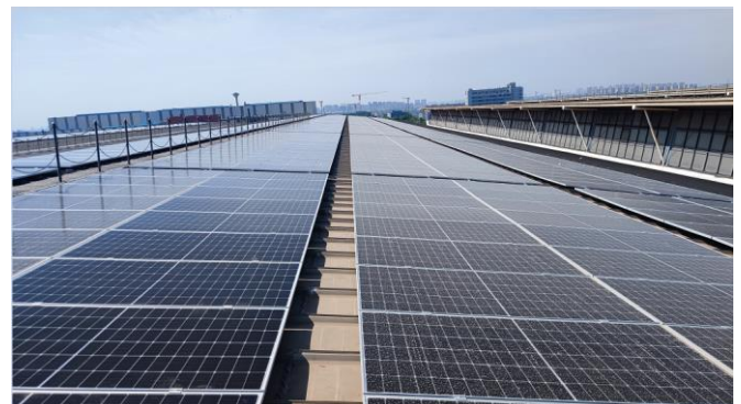
Solar roof made of 13 000 solar panels installed at GE Hydro Tianjin site

100% of our sites are powered with renewable energy. This green energy supply is ensured through Green Tariff Electricity contracts (Europe and North America) and Renewable Energy Certificates (Other sites).