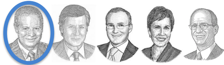
Mulva, Bazin, Garden, Seidman & Tisch