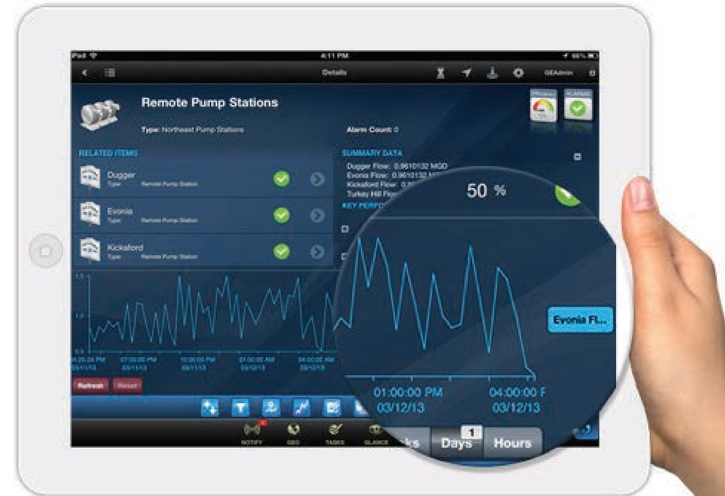
Smart Boiler with the Boiler Reasoner Pack helps you detect and predict issues based on the equipment type.

Hardware and software requirements are representative and may vary by customer deployment. Please consult the product documentation for more details.