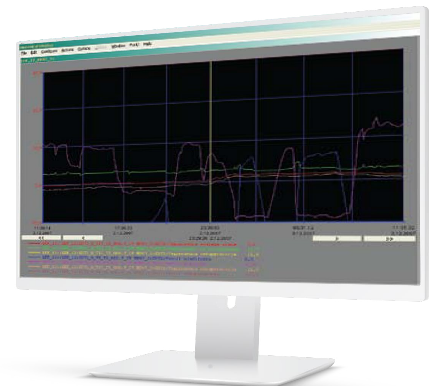
Trends of the process variables: temperatures (fresh air temperature, temperature behind refrigerator, etc.) and valves