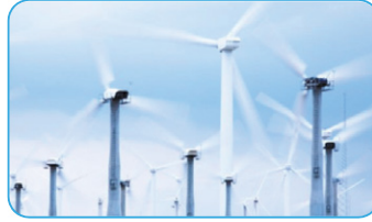
Renewable and DER