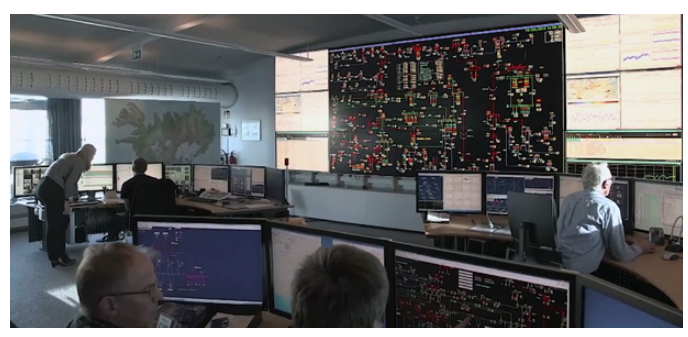
Landsnet control room, showing PhasorPoint in use.