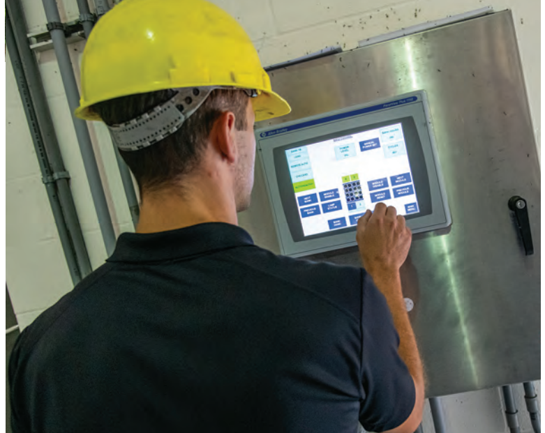
Callahan checks the status of the TrojanUV4000Plus (TrojanUV) disinfection system.

The plant also has a unique post-disinfection treatment stage: An experimental constructed wetland removes nutrients from about half of the plant's discharge. The wetland has hiking trails and bird-watching sites that make it a getaway for area citizens.