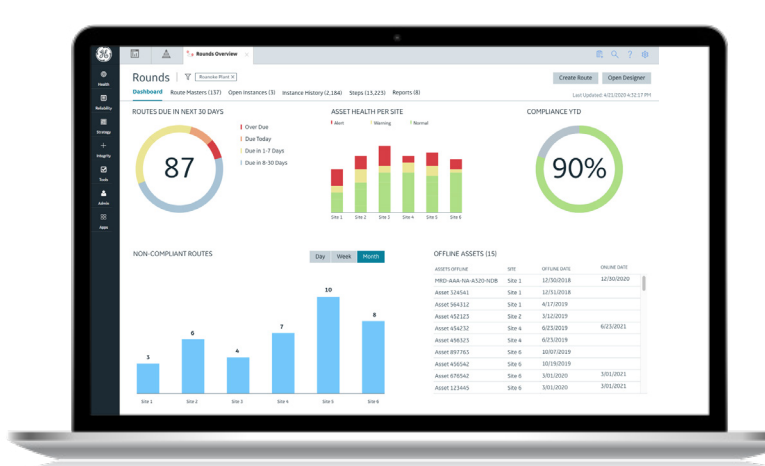
Route tracking dashboard