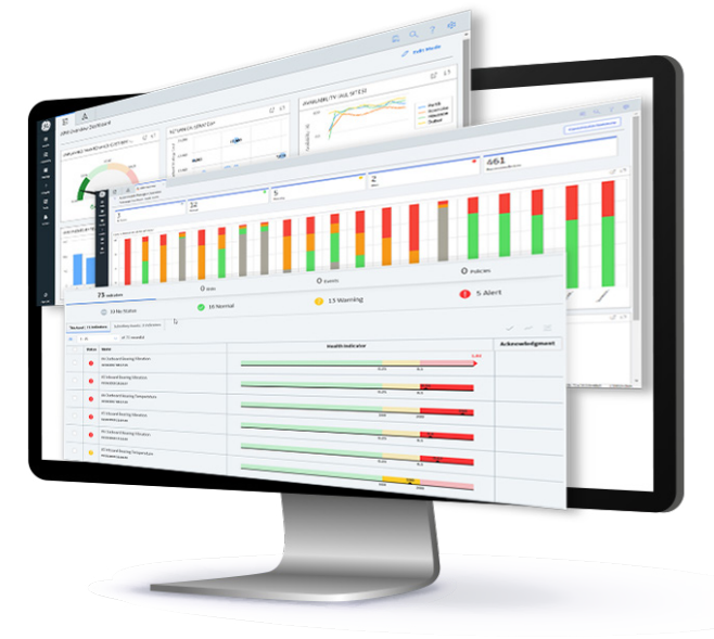
APM-powered dashboards and functions