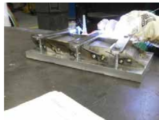
Assemble Partial Steam Paths