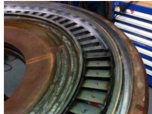
Fit and Tack