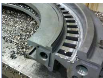
Steam Path Machined