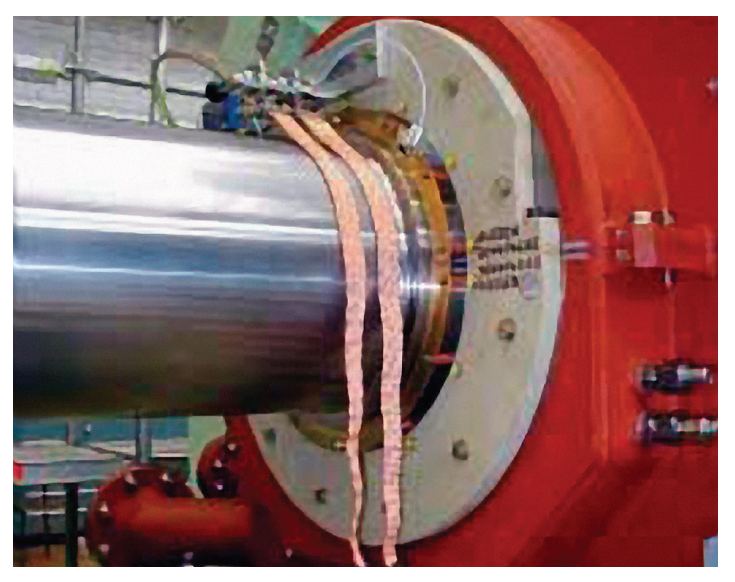
Installed shaft grounding strips on DE bearing pedestal

These automatic indicators are displayed clearly in the user interface.