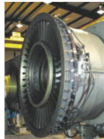
Variable Inlet Guide Vanes Assembly