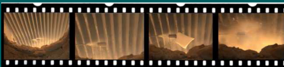
Water-cooled lance in Boiler