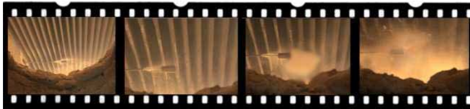
Lance in HRSG