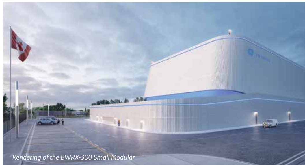
Rendering of the BWRX-300 Small Modular

GE is unique as a company with a large footprint and lengthy history in Canada as well as a global reach throughout the full power generation lifecycle. Through this lens, we see that accelerated and strategic deployment of renewable energy, nuclear, energy storage, hydrogen, CCUS, and gas power can help change the global trajectory of climate change, enabling substantive reductions in emissions while continuing to accelerate technologies for low or near zero-carbon power generation.