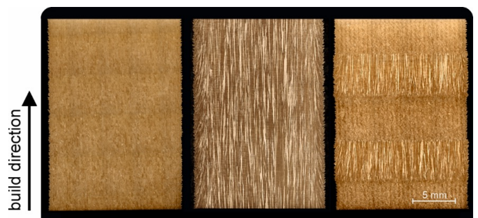
Microstructure control as enabled by EBM Point Melt technology

This will enable material properties tailored to the different functions of the part, for example, printing turbine blades using isotropic solidification for the blade root and directional solidification for the main blade body.