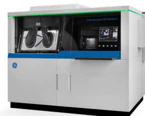
M2 Series 5

Ideal for medical implants with porous surface finishes with the capability to stack parts in a single build for high productivity.