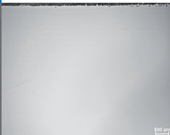
Test piece (x 20 magnification)